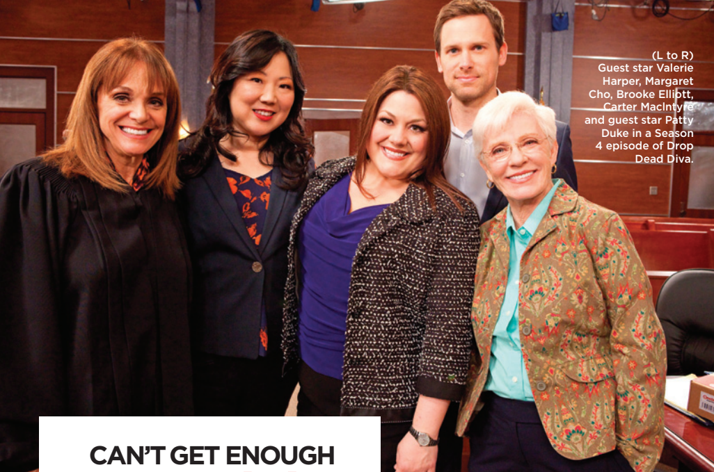
(L to R) Guest star Valerie Harper, Margaret Cho, Brooke Elliott, Carter MacIntyre and guest star Patty Duke in a Season 4 episode of Drop Dead Diva.